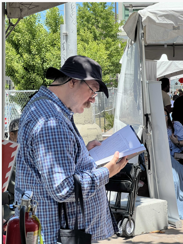
Dim Simple - Book Launch