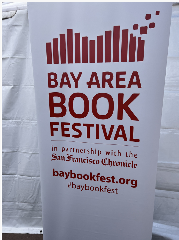
Dim Simple - Bay Area Book Festival Book Launch