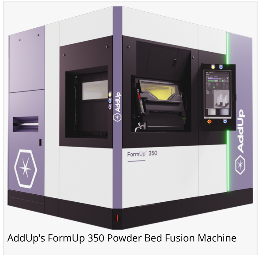
AddUp's FormUp 350 Powder Bed Fusion Machine

Previously, the manufacturing of the tire sipe mold component was outsourced overseas, leading to supply chain inefficiencies and high costs for King Machine. To address these issues and remain competitive in the U.S. market, vertical integration was a necessary step. By bringing the manufacturing process in-house with additive technology, King Machine has improved profitability, enhanced sustainability, and elevated their capabilities, enabling their customers to set a new standard in quality and performance in servicing their clients. This strategic move also aligns with King Machine's commitment to proactive tire sipe and mold development, in collaboration with their top customers.