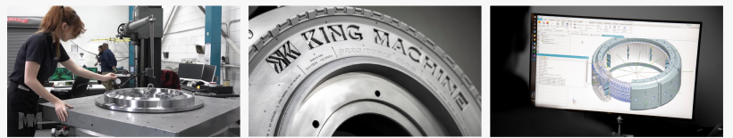
King Machine Mold Making Capabilities