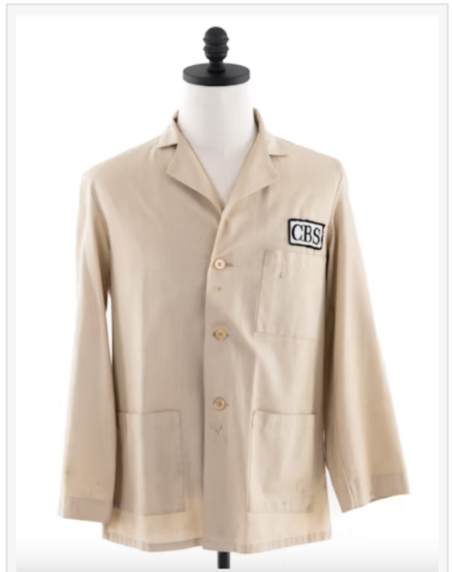
Ringo Starr Signed CBS Records Employee Jacket from the Ed Sullivan Show

This press release can be viewed online at: https://www.einpresswire.com/article/720556473