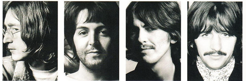
Outtake images from The Beatles "White Album"

auction. New auction items will be live on 10am PST today on ANALOGr.com, including rare and iconic artifacts from the lives and careers of The Beatles, many of which represent pivotal moments in music history. This exclusive event promises to captivate Beatles enthusiasts and