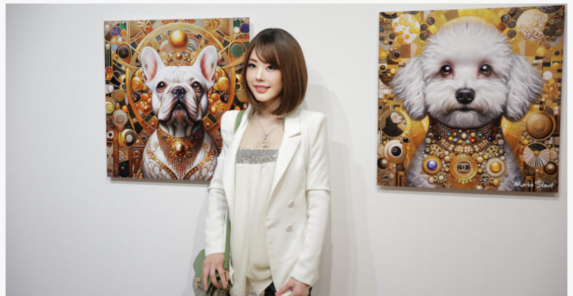
Embracing the opulence of Marko Stout's Swag Dogs collection at the gallery