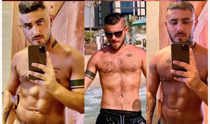
After Transformation Results