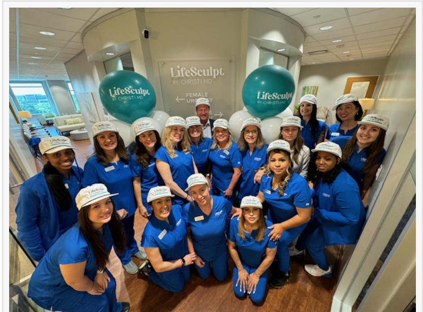
LifeSculpt by ChristiMD launch party at their Houston Medical Spa

Specializing in longevity, biohacking, aesthetics, and urogynecological health, LifeSculpt combines traditional medicine with cutting-edge approaches to deliver personalized and holistic wellness solutions.