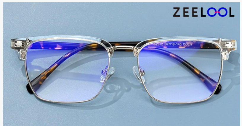
Blue light blocking glasses