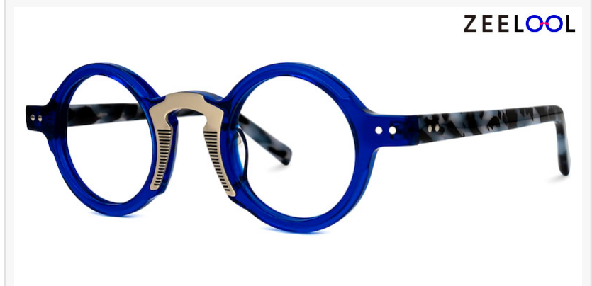
Retro round glasses