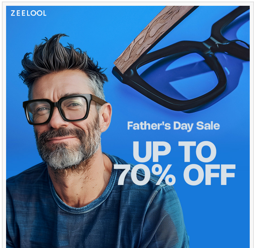
Zeelool Father's Day Eyewear