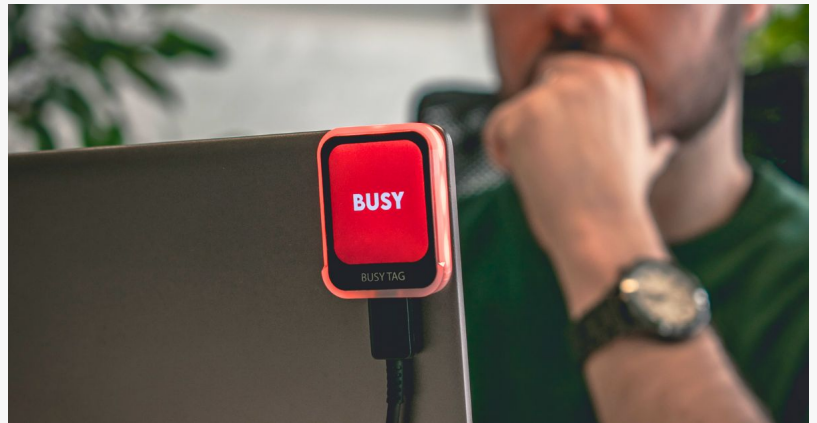
The Busy Tag in use on a computer

LOS ANGELES, CA, USA, June 12, 2024 /EINPresswire.com/ -- Busy Tag , the revolutionary interactive smart gadget, is now available for consumers globally. The Busy Tag is a brand new productivity and communication device that combines a customizable display with a built-in LED busy light, empowering people to take control of their workday and manage their personal or professional expression in a creative way.