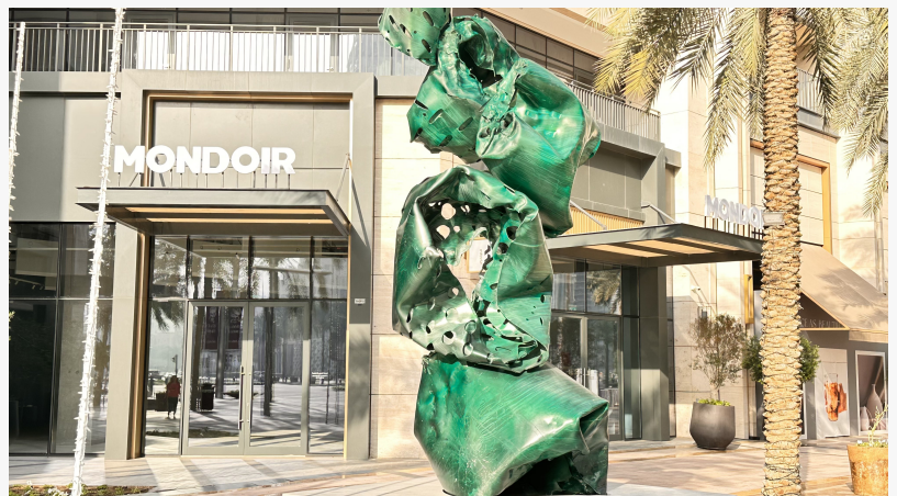
The Mondoir Gallery in Downtown Dubai.