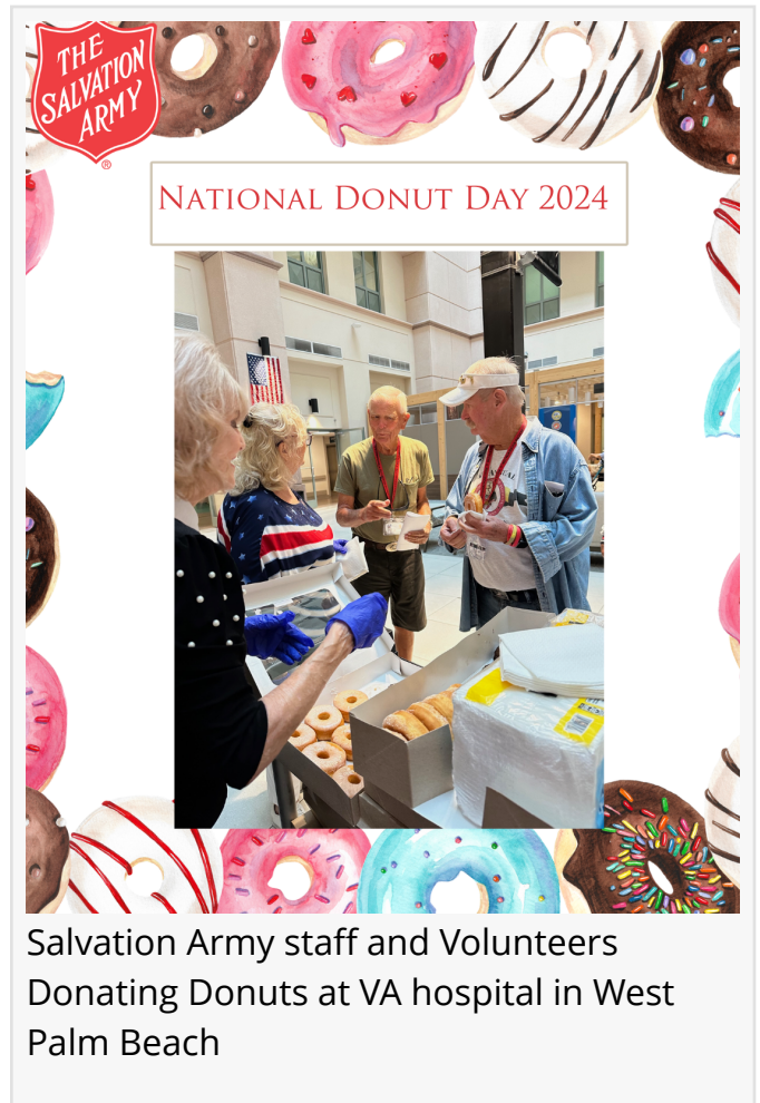
Salvation Army staff and Volunteers Donating Donuts at VA hospital in West Palm Beach