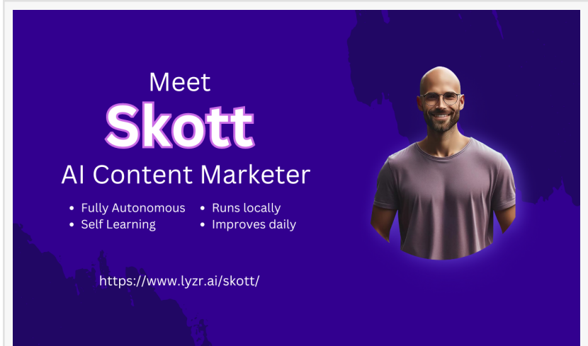
Skott - The Fully Autonomous AI Content Marketer from Lyzr

/EINPresswire.com/ -- Today, Lyzr AI unveiled Skott , an advanced AI Content Marketer engineered to autonomously perform a wide array of digital marketing tasks, from in-depth research to writing and cross-platform publishing. This tool is designed to support businesses in maintaining a persistent digital presence by efficiently managing content creation without the overhead associated with large marketing teams.