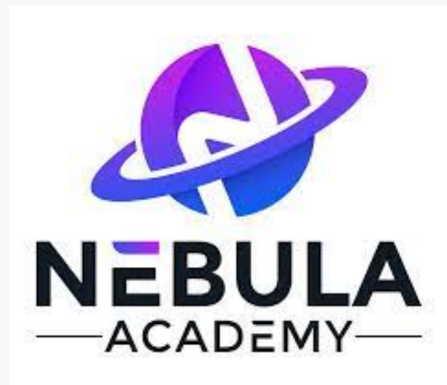
Nebula Academy logo