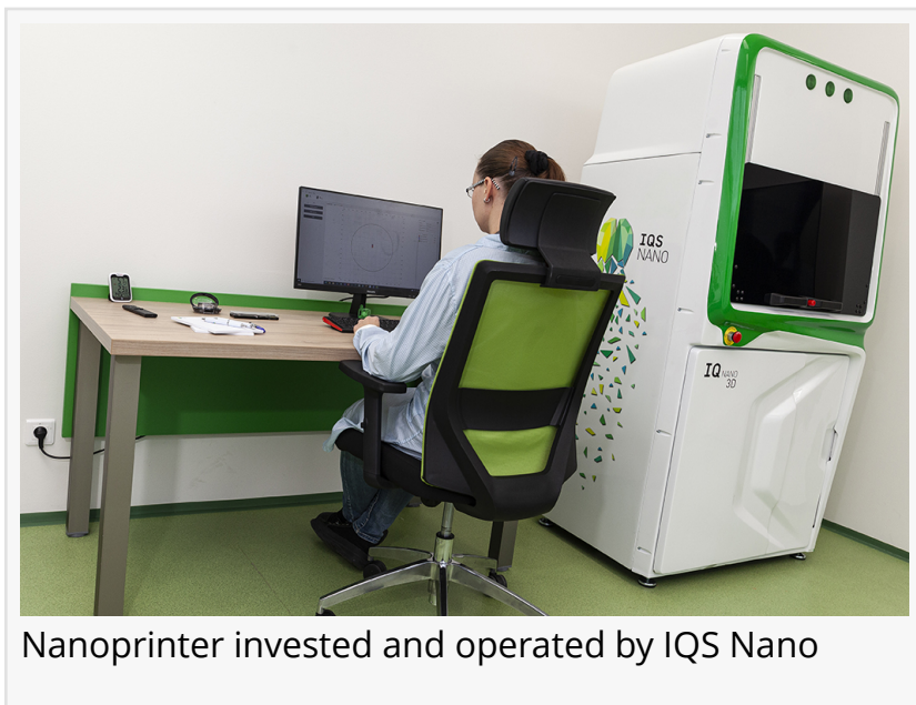
Nanoprinter invested and operated by IQS Nano

hour. ResIQ Hybrid-one material was used for production. The photo of the nano model was taken by Filip Mika from the Institute of Scientific Instruments of the Czech Academy of Sciences.