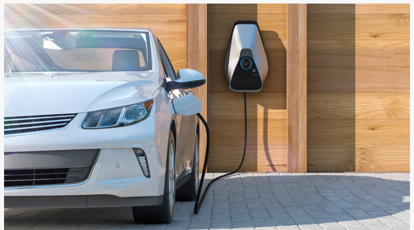
Convenient, Predictable & Affordable EV Charging