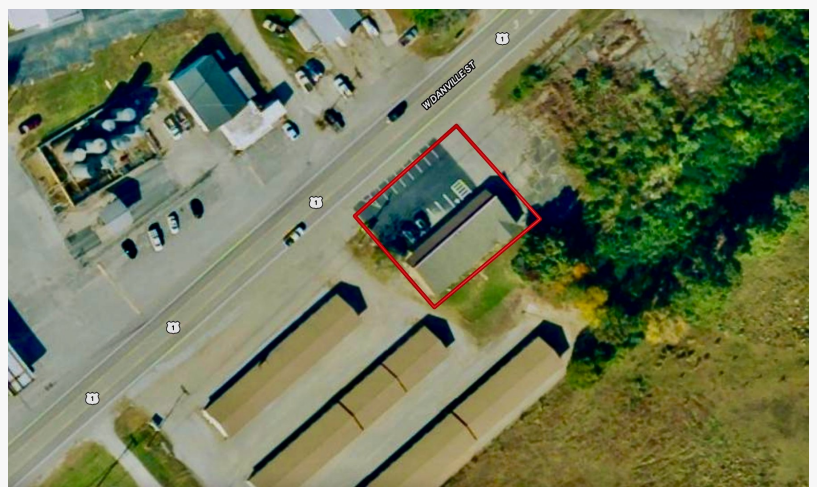
1361-1369 West Danville Street, South Hill, VA 23970