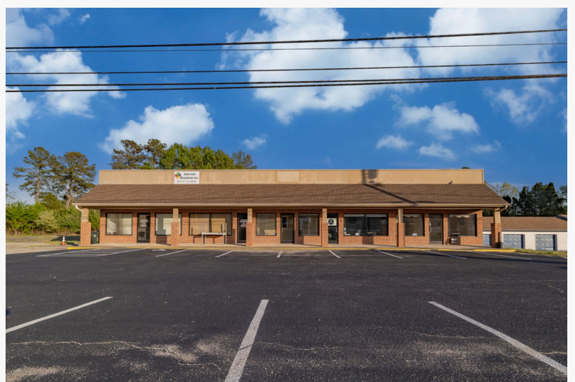
1361-1369 West Danville Street, South Hill, VA 23970