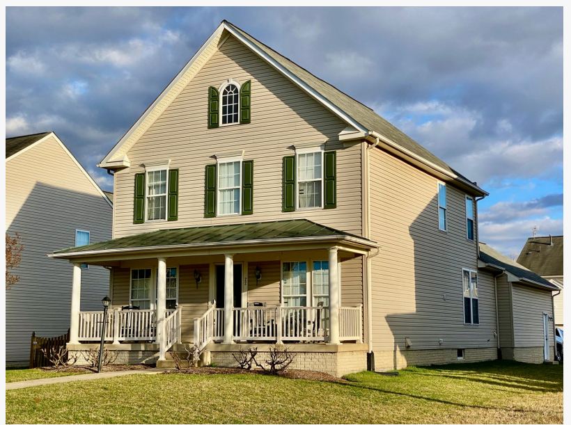
22 Lovett Dr., Lovettsville, VA 20180