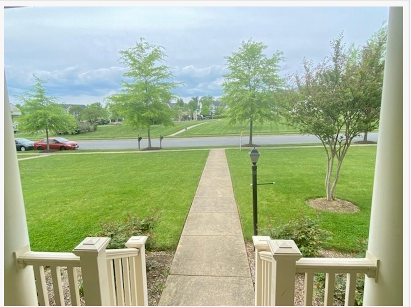
22 Lovett Dr., Lovettsville, VA 20180