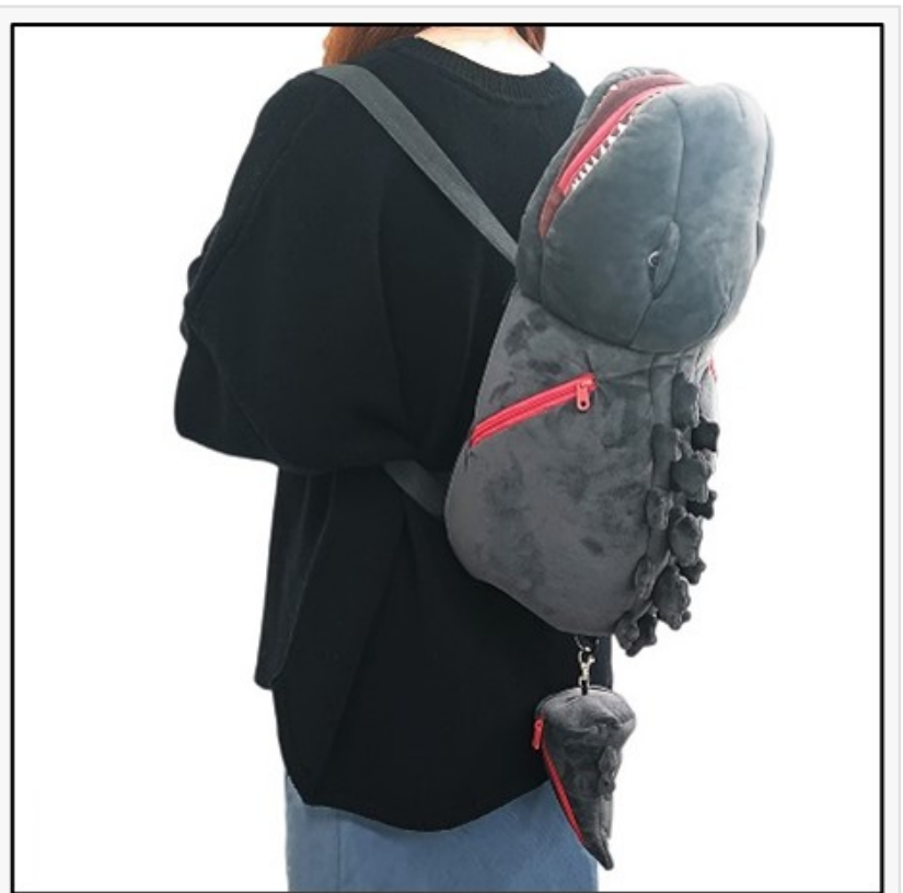
□ "Nijigen no Mori"-exclusive Godzilla backpack

This press release can be viewed online at: https://www.einpresswire.com/article/714288049