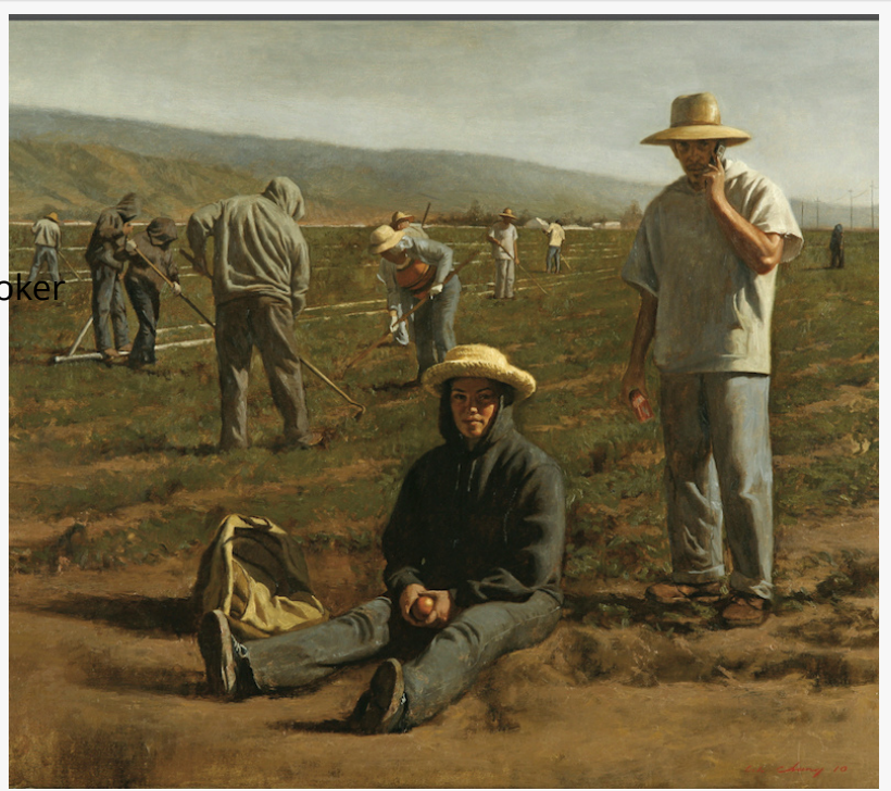
Artwork by Warren Chang

This press release can be viewed online at: https://www.einpresswire.com/article/713886307