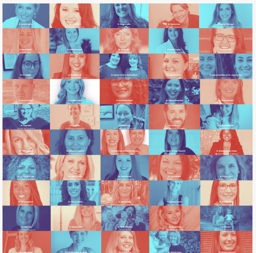
The 'Brain, Not Bone Alone' Founding 50 elevating our perception of chiropractic care and its profound neurological benefits.

PUYALLUP, WA, UNITED STATES, May 22, 2024 /EINPresswire.com/ -- The 'Brain, Not Bone Alone' ( BNBA ) initiative today proudly recognizes " The Founding 50 ," a group of visionary chiropractors who have been instrumental in elevating the chiropractic profession's public perception by emphasizing its crucial role in enhancing neurological benefits. These pioneers are dedicated to promoting optimal health by ensuring that body organs communicate effectively. Chiropractors are uniquely trained healthcare providers who ensure these vital pathways remain clear, safeguarding your body's ability to achieve optimal wellness and function at its best.