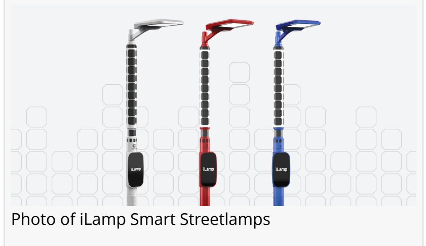
Photo of iLamp Smart Streetlamps