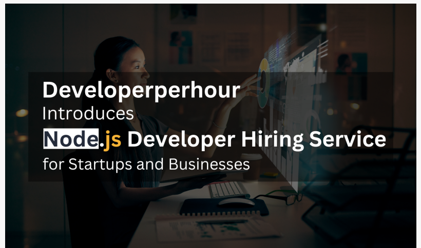
DPH launched Hire Node.js developers service

This bold and innovative offering is committed to helping SMBs and enterprises by providing multiple services, including augmenting in-house development staff with highly skilled Node.js developers or teams to meet the evolving needs of businesses worldwide at cost-effective prices.