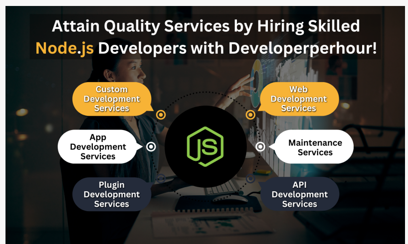
Node js Development Services