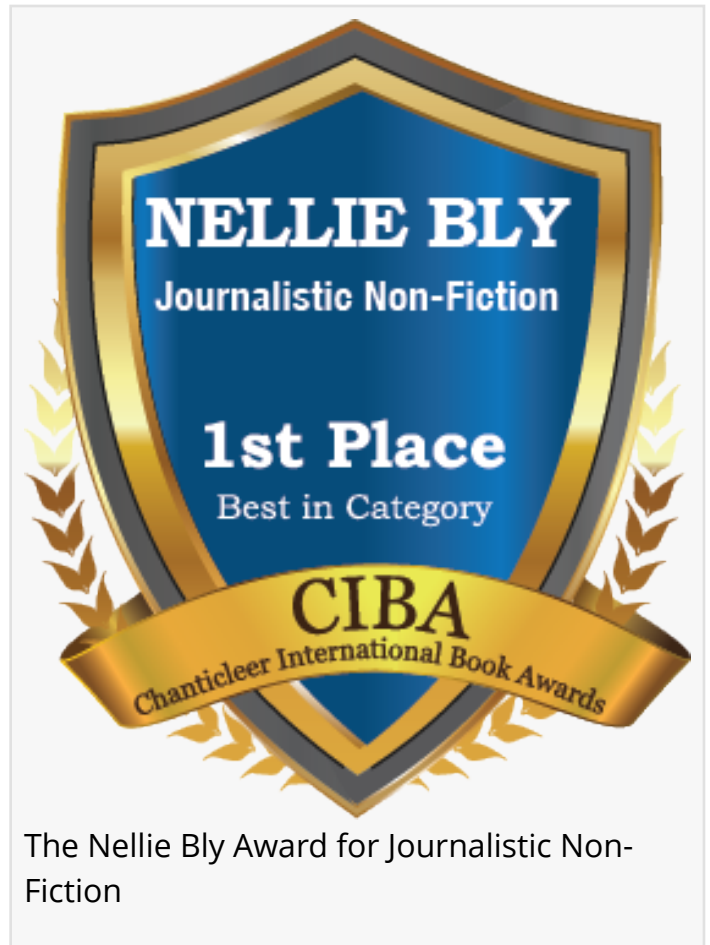
The Nellie Bly Award for Journalistic Non-Fiction