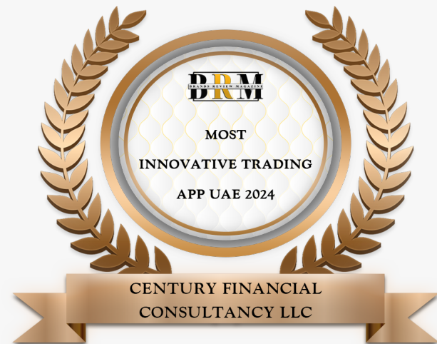
Century Financial Consultancy Trader LLC wins the Most Innovative Trading App UAE 2024

To ensure that the brokers get the best experience while trading, Century Financial has the best trading tools and platforms that can help them maximise their trading experience, such as Meta