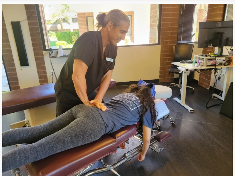
Advance Spine & Posture Doctor Adjusting Patient