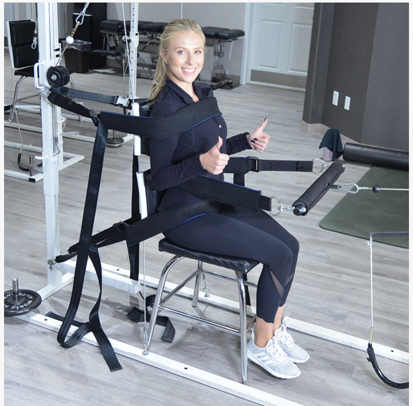
Chiropractic BioPhysics at Advanced Spine & Posture