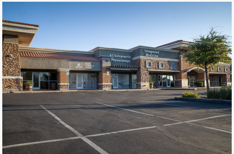
Advanced Spine & Posture North West Las Vegas

This press release can be viewed online at: https://www.einpresswire.com/article/711242490