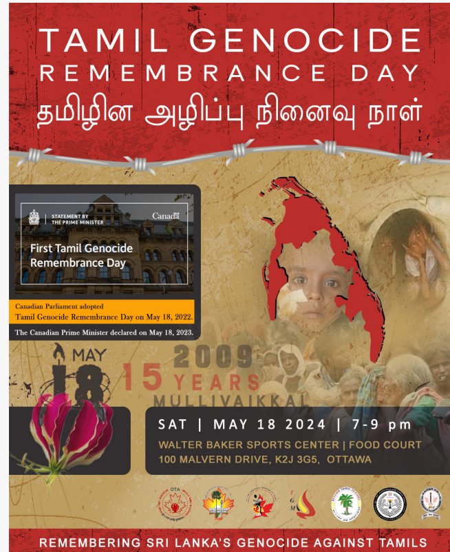
Tamil Genocide Remembrance Day in Ottawa on May 18, 2024

A ceremony of holding a lamp, as a symbol of Tamil resilience, will take place. Mullivaikkal Kanji will be provided as it marks a moment in the history of Tamil people who