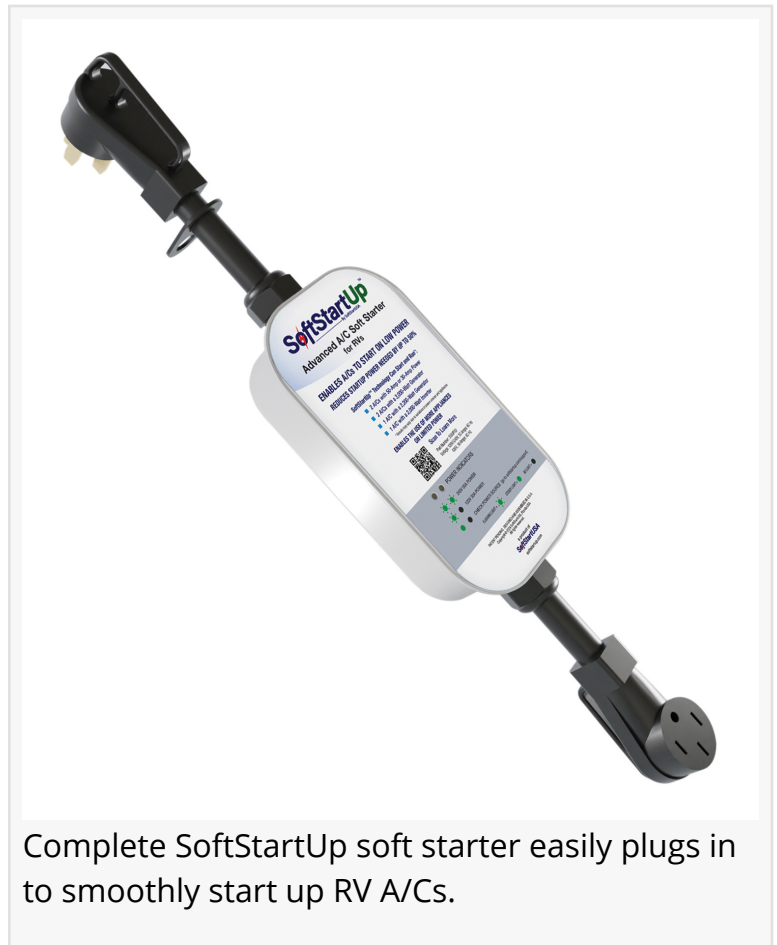
Complete SoftStartUp soft starter easily plugs in to smoothly start up RV A/Cs.

Because SoftStartUp cuts the inrush current of all “hard-starting” appliances by 50% (such as air conditioners, refrigerators, microwave ovens, etc.), the RV’s main power won’t trip off when these appliances start while others are operating. Water heaters, coffee makers, lights, hair dryers and