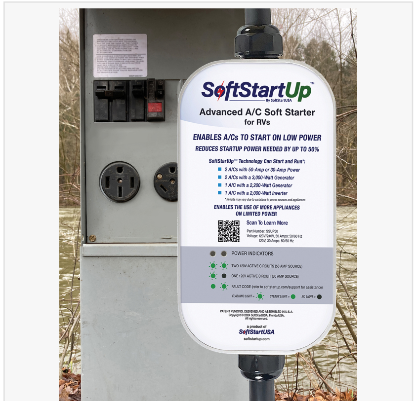
SoftStartUp plugs directly into 50-amp outlet or 30-amp outlet with provided adapter.