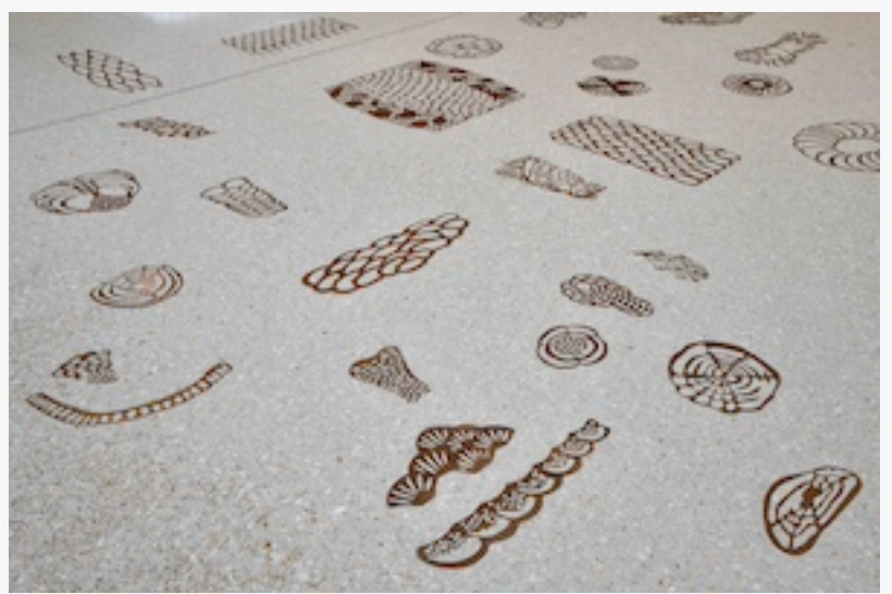
BRASS ART inlays in the terrazzo floor symbolize the geological movement of the nearby Red Cedar River.

Dominating the three-story glass-enclosed atrium in the Minskoff Pavilion is a sweeping grand staircase crafted from precast terrazzo and meticulously detailed with stainless steel inserts. The angled staircase, accompanied by wooden bench seating, is a dynamic flourish in the light-filled space. Mirrored ceilings underneath pedestrian bridges over the atrium reflect the floor. Terrazzo expansion joints connect the new installation to terrazzo in the existing building, blending functionality with aesthetics.