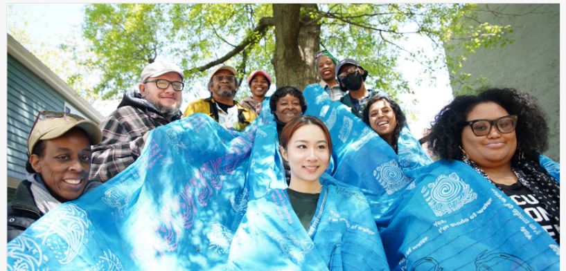
SWIMMING Workshop Participants