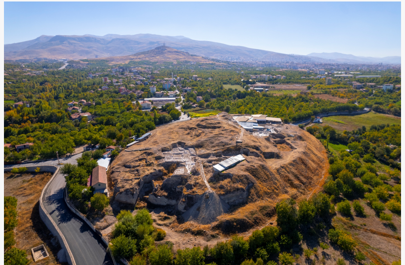
UNESCO World Heritage List