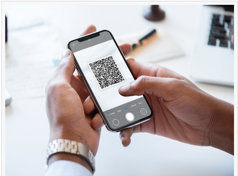
Verse Capture QR code

Verse’s platform is fully-managed and fully compliant, so businesses have peace of mind knowing that best practices are enforced at customer-opt-in—and throughout every step of the