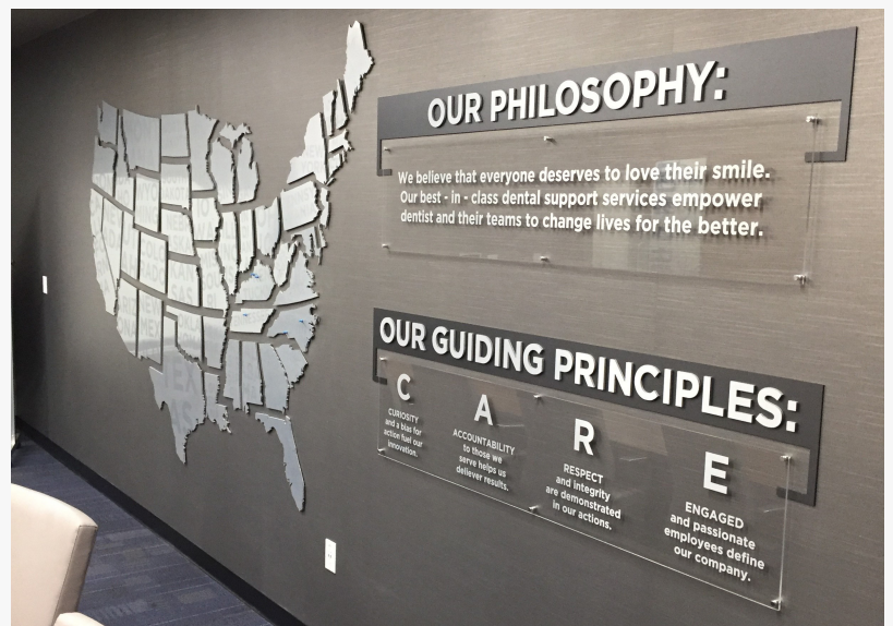
A Heritage produced and installed Mission Wall Display