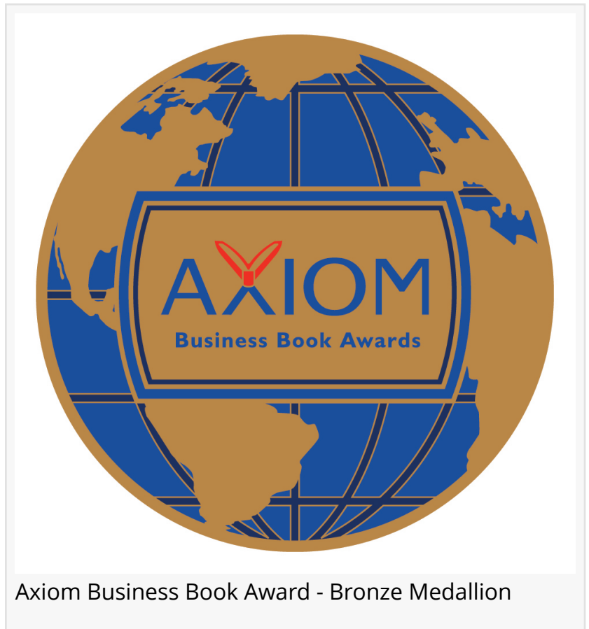
Axiom Business Book Award - Bronze Medallion