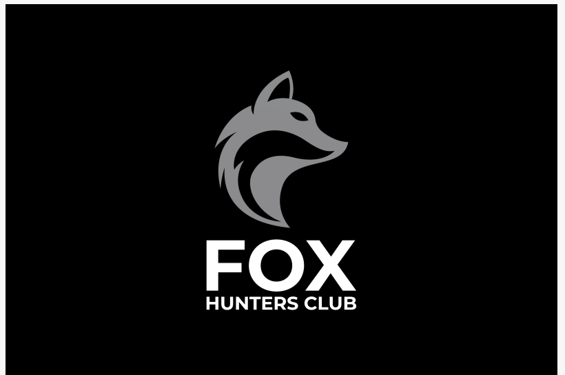
Fox Hunters Club logo

NEW YORK, NY, USA, April 16, 2024 /EINPresswire.com/ -- Fox Hunters Club, the first dating app targeting millennial women seeking committed relationships with older men, announced today that it has exited stealth mode and will officially launch on April 24 in the New York City area. Developed with the discerning dater in mind, Fox Hunters Club is a game-changer in the industry, offering an elevated alternative to sugar baby apps.