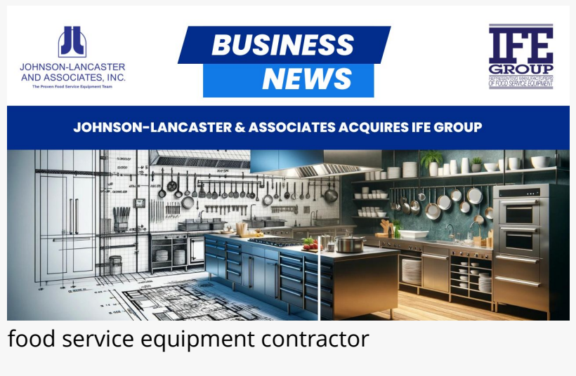
food service equipment contractor