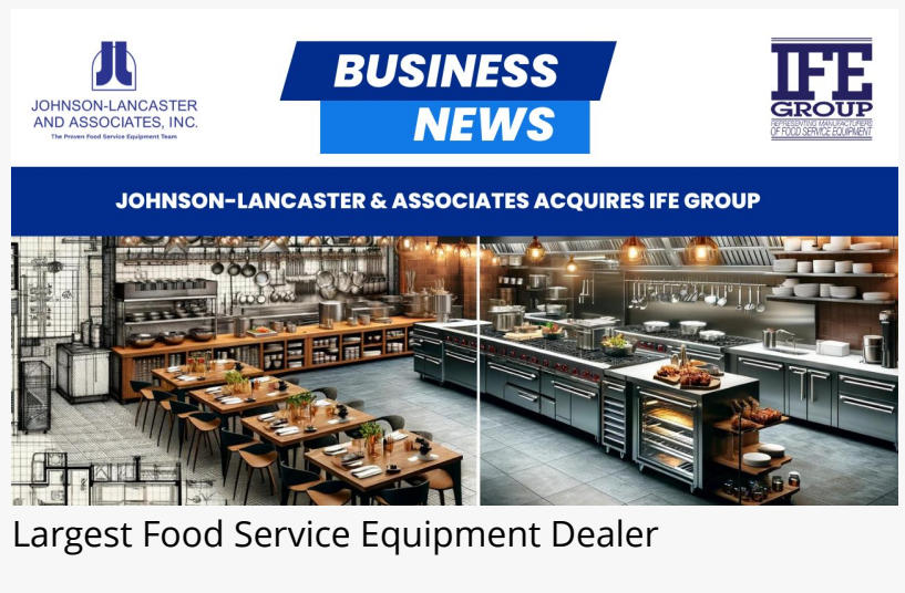
Largest Food Service Equipment Dealer