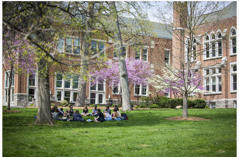
Drew University, a Phi Beta Kappa liberal arts university located in Madison, NJ, hosts the George and Alicia Karpati Lectureship each year