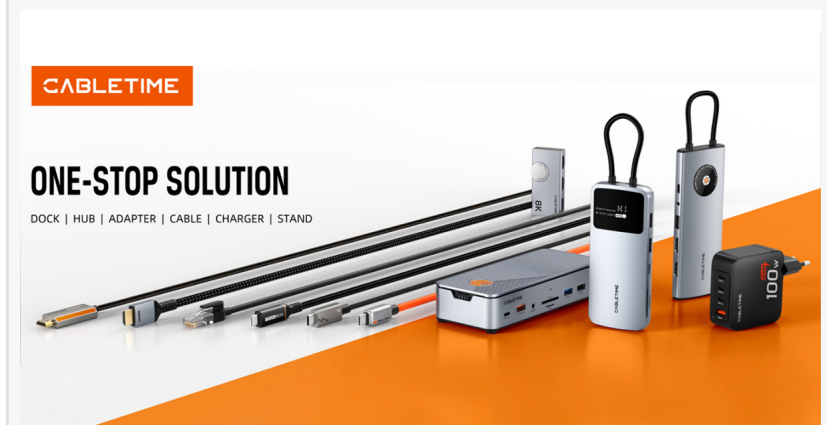
CABLETIME One-stop Solution