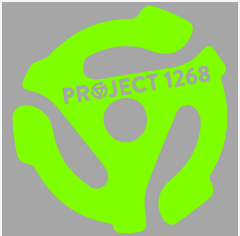
The band Project 1268 releases a new music video of their new hit Me Now Free.