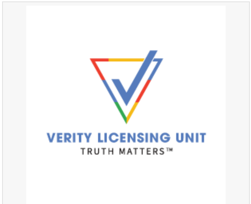
Verity One Licensing Unit