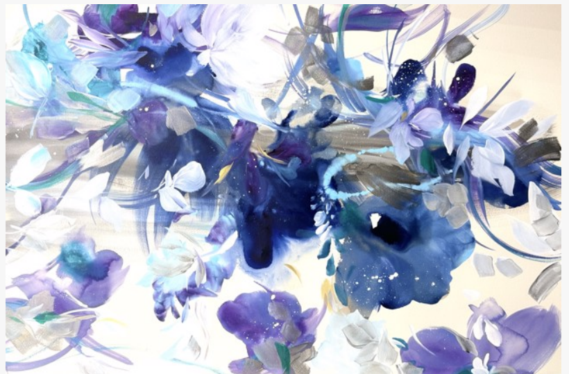
Apotheosis | Jennifer JL Jones | Painting on paper | 40 x 60 in | Courtesy of New River Fine Art