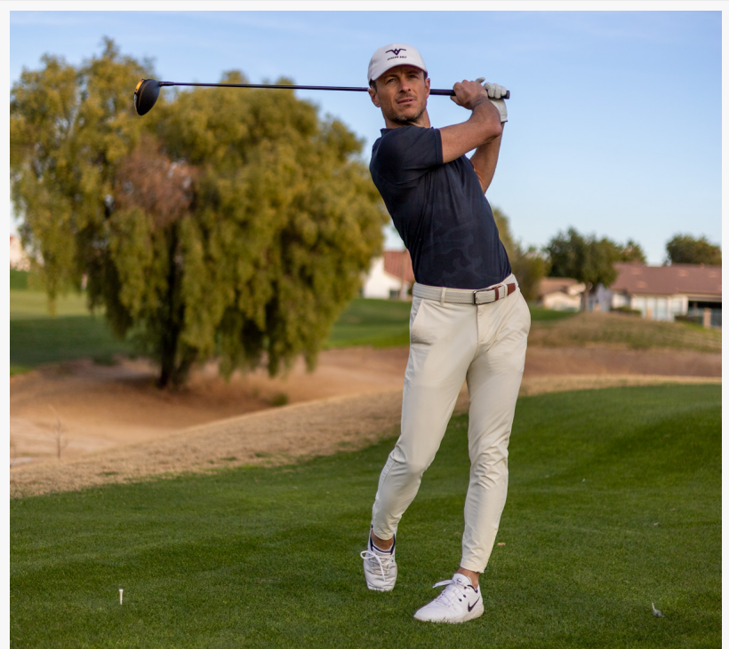
2024 Avalon Golf Joggers Press Release

The Largest Golf Joggers Collection Avalon offers 4 distinct styles of Mens Golf Jogger Pants that are catered towards fashion conscious golfers who demand style without sacrificing performance and comfort. All Avalon Joggers are handcrafted with superior attention to detail on tailoring – offering a slim-fit cut with tapered legs that will provide customers a refined, polished look for the course. Designed as true joggers for golf, Avalon highlights all their pants with tapered legs, elastic ankle cuffs and side ankle zippers. Fabric and materials are also critical when crafting the best golf joggers and Avalon specially