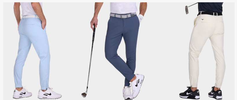
Avalon Tour Golf Jogger Pants