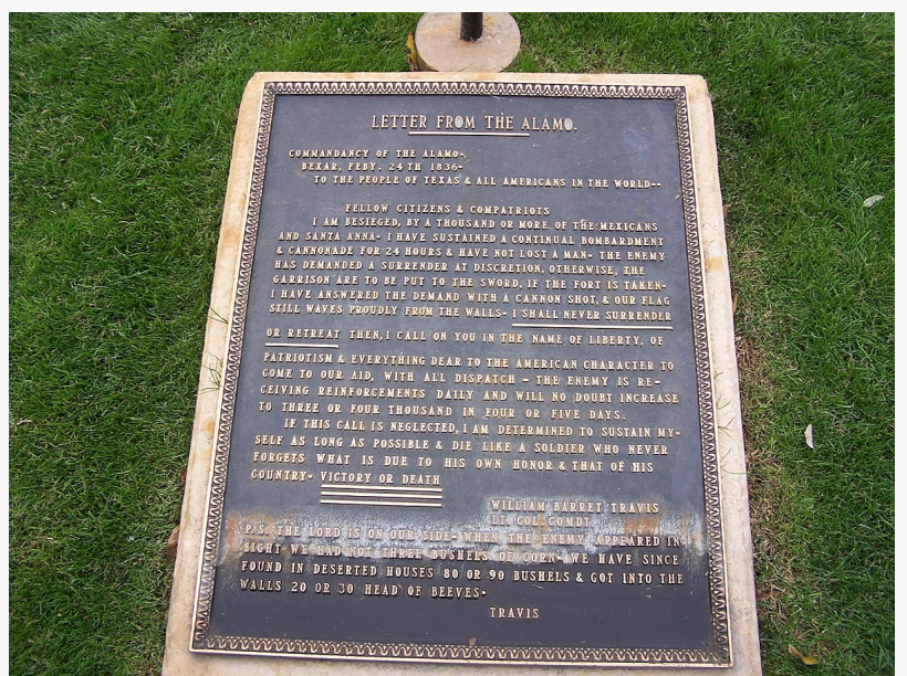
The Col. William Travis Alamo Letter in front of the Alamo Chapel in San Antonio