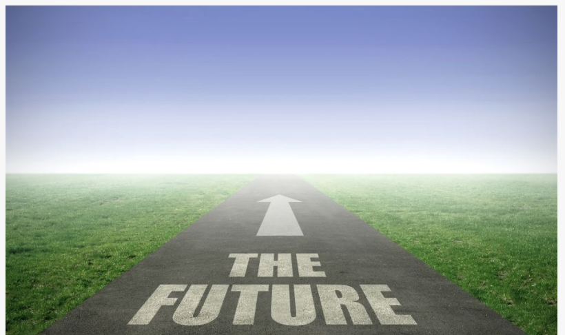
The future of timeshare?

NEW YORK, NY, USA, January 15, 2024 /EINPresswire.com/ -- The most common complaints received by Timeshare Advice Center are about high pressure sales, spiraling maintenance fees, ineffective holiday systems and being trapped in inescapable contracts. Has Florida based timeshare company MyMVP Club finally got things right?