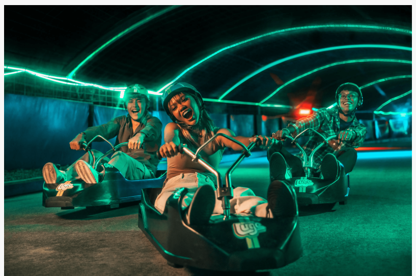
Be thrilled as you zip down the tracks to exciting beats at Ride the Beat

/EINPresswire.com/ -- Skyline Luge Singapore — one of Sentosa's beloved and popular attractions — is proud to unveil Ride the Beat, a fun new sensory experience that refreshes the well-known Skyline Luge experience. As the first Skyline Luge site in the world to bring music onto its tracks, Ride the Beat is a new experience offering a musical joyride. Ride the soundwaves and zip down neon-lined tracks to the rhythm of popular music and beats every Friday and Saturday from 7pm – 10pm.