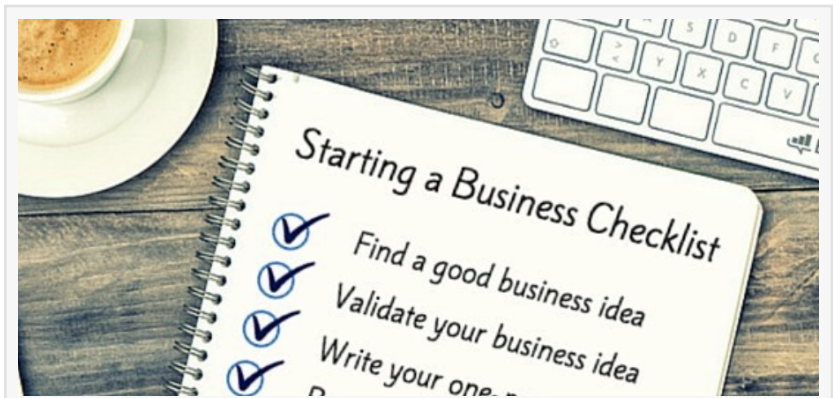
Startup Business https://llc.as.gov

Setting up a limited liability company (LLC) in American Samoa can help establish an independent legal entity for conducting business operations and holding cryptocurrencies such