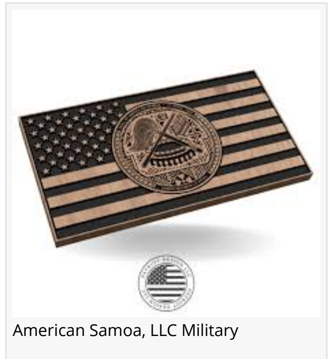
American Samoa, LLC Military

This press release can be viewed online at: https://www.einpresswire.com/article/678227410