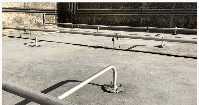
BioMix Compressed Gas Mixing System

CHARLESTON, SOUTH CAROLINA, UNITED STATES, December 21, 2023 /EINPresswire.com/ -- EnviroMix Inc. is excited to start 2024 with new representation in upstate New York, the New York City metro area including northern New Jersey and southwestern Connecticut, and the southern region of Louisiana, Mississippi, Arkansas, and western Tennessee. EnviroMix relies on a team of manufacturers' representatives to promote the company's mixing and process technologies to water and wastewater facilities throughout the country. In partnership with the following three representatives, EnviroMix solutions — including the company's flagship product BioMix Compressed Gas Mixing and the award-winning BioMix-DC Enhanced Anaerobic Mixing — will continue to be readily available to treatment plants in these regions.