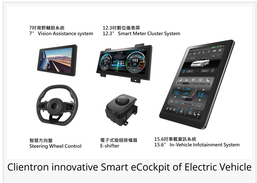
Clientron innovative Smart eCockpit of Electric Vehicle

Defined Hardware (SDH) serving as the design core. This forward-looking approach empowers