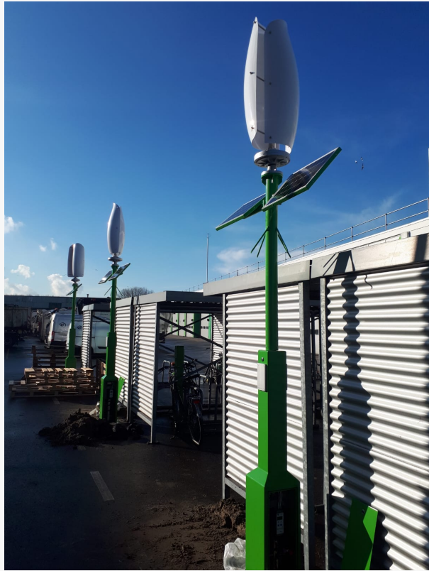
Wind and Solar E-bike Charging Poles