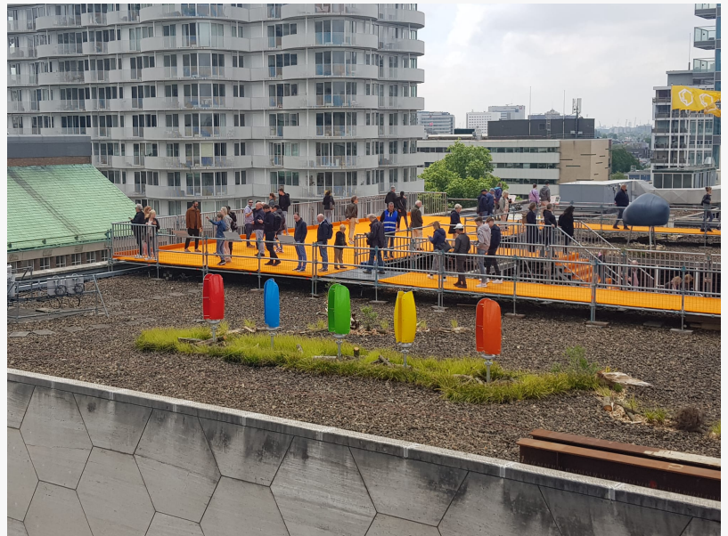
Flower Turbines at Rotterdam Roof Days