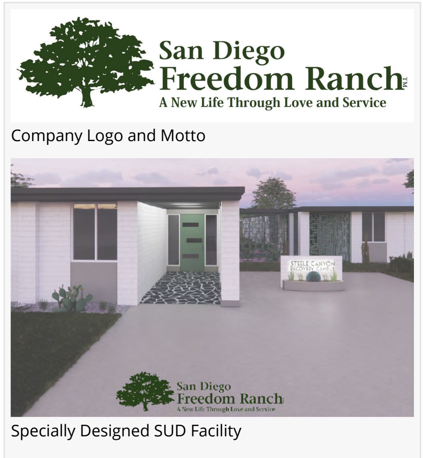
Company Logo and Motto

SAN DIEGO, CA, USA, December 1, 2023 /EINPresswire.com/ -- The number of deaths due to drug overdose has risen sharply over the last decade, and few parts of the country have been harder hit than San Diego. According to the San Diego County Health and Human Service Agency, in San Diego County, there were more than 1,300 drug overdose deaths in 2021, approximately 75% being from fentanyl. The deaths span the entire county, affecting every community and zip code.