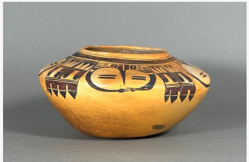
Large, circa 1910 Nampeyo of Hano Hopi baluster form pottery jar in yellow slip, decorated with pictographic designs in brown and burnished, 7 inches tall ($7,995).

A Curtis Jere circular form wall mirror welded with various sizes of circular formed patinated