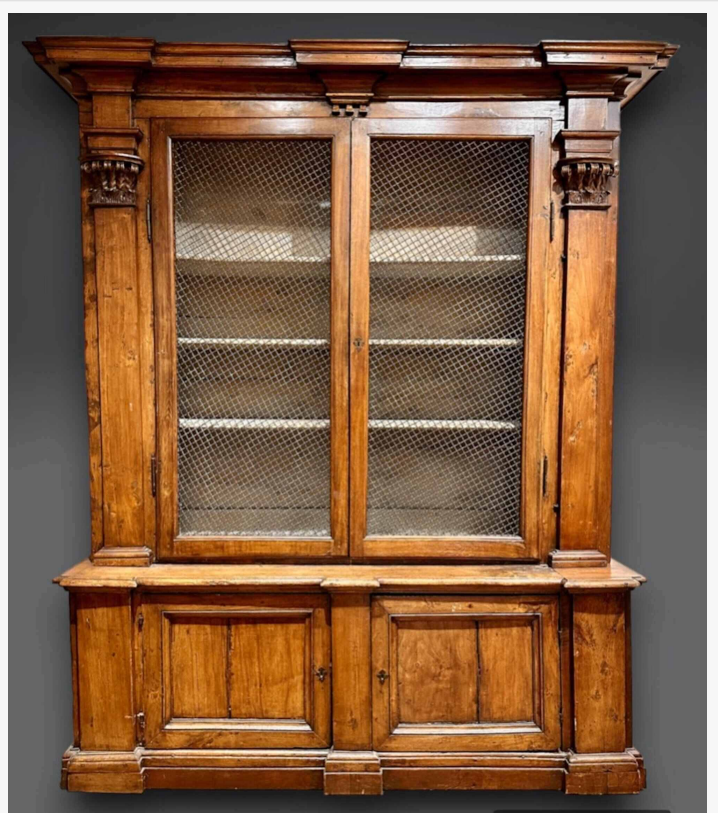
18th century Italian Baroque walnut two-part cabinet, 93 inches tall by 80 inches wide, the interior painted light blue and the doors flanked by engaged Corinthian capitals ($4,059).

Cynthia Maciejewski Neue Auctions +1 216-245-6707 email us here